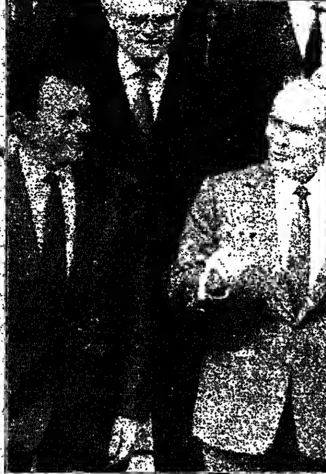
President François Mitterrand, right, with Prime Minister Michel Rocard, left, and Education Minister Lionel Jospin on Friday.